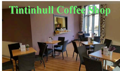
Some of our volunteers